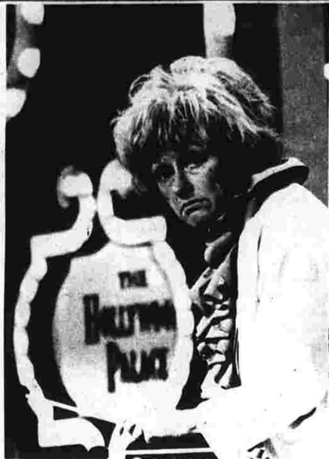
Phyllis Diller, hostess on ABC's "The Hollywood Palace" Tuesday 10-11 p.m. Johnny Ray is a guest.