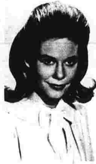
Elizabeth Montgomery will be seen in ABC's "Bewitched" Monday through Friday noon to 12:30 p.m. starting New Year's Day.