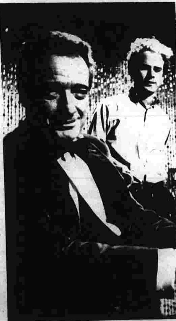
Victor Borge with folk singer Art Garfunkel on NBC's "Kraft Music Hall" Wednesday 9-10 p.m.