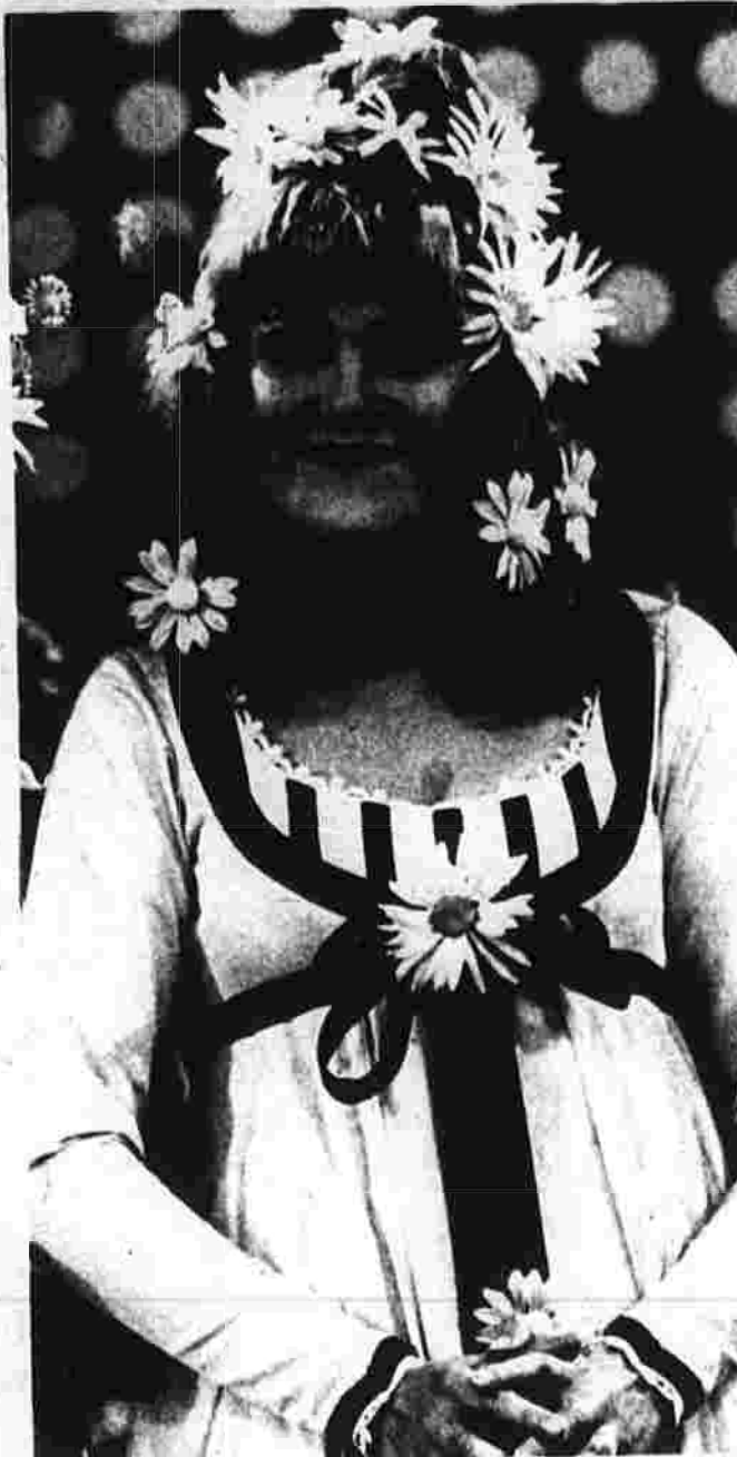
English actress Lynn Redgrave in a puckish mood on CBS's "Carol Burnett Show" Monday at 10 p.m.

But he's through with globe trotting, he claims, and has stopped moving long enough to guest on the Phyllis Diller-hosted outing of ABC-TV's "The Hollywood Palace."